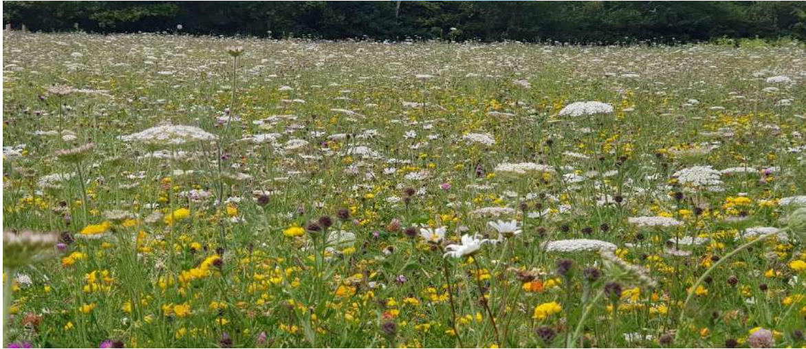
Figure 4 meadow year 3 high percentage of wildflowers now present