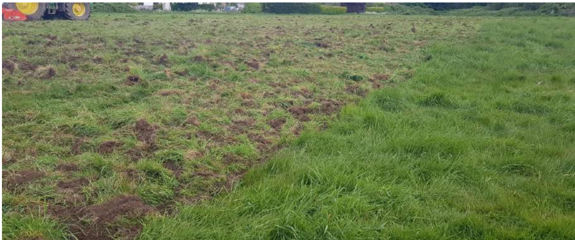
Figure 1. turf cultivated with powered equipment

Fairford is located along a “bee-line” so adding wildflower areas, allows movement through the town for insects. Not only helping locally but adding to a landscape scale helping support biodiversity regionally.