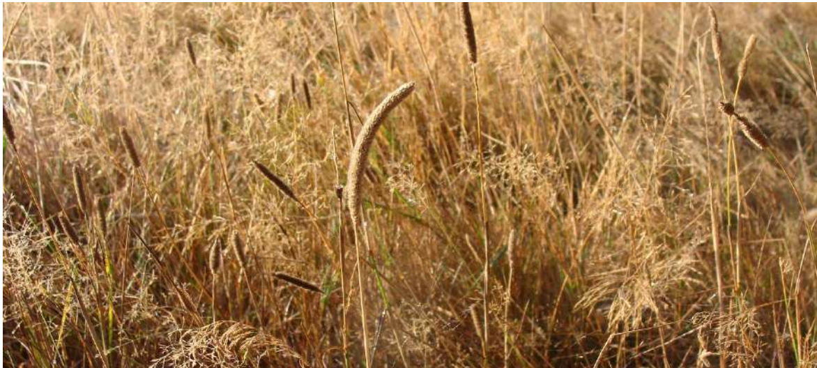
Figure 2 meadow growth year 1 with high percentage of grasses

March to April, to even out winter growth, and at the end of the season, in September, once the plants have gone to seed.