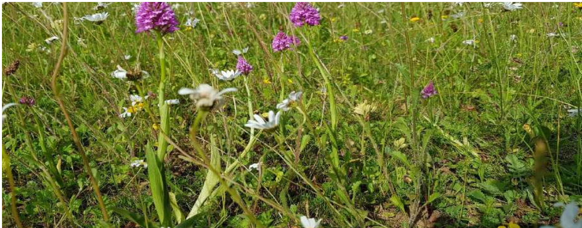
Figure 5 meadow year 5 a well-established meadow with little to no grass

For instant effect other areas will have native bulbs planted giving brilliantly bright bouquets to benefit bugs and brighten borders.