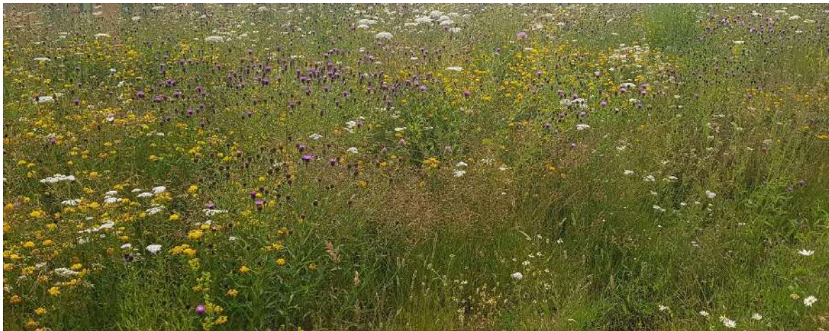
Figure 3 meadow year 2 with more of the wildflowers coming through

We will be selecting native perennial wildflowers and introducing these to existing grass areas. As many species require the right conditions to grow and can take several seasons to flower many areas will take more than one summer before producing flowers, so we ask for your patience while they are establishing.