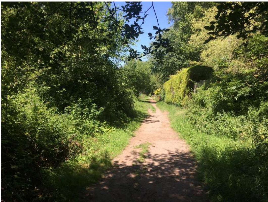
Section 9 (path)