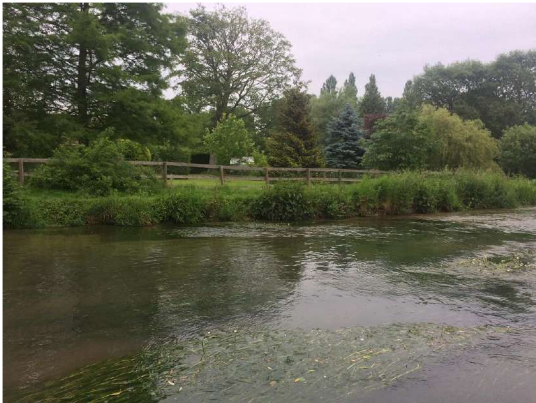
Section 2 (left bank of river, photo taken looking across river)