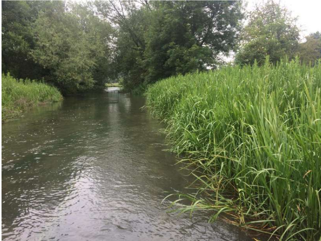
Sections 8 and 9 (river, photo taken facing downstream)