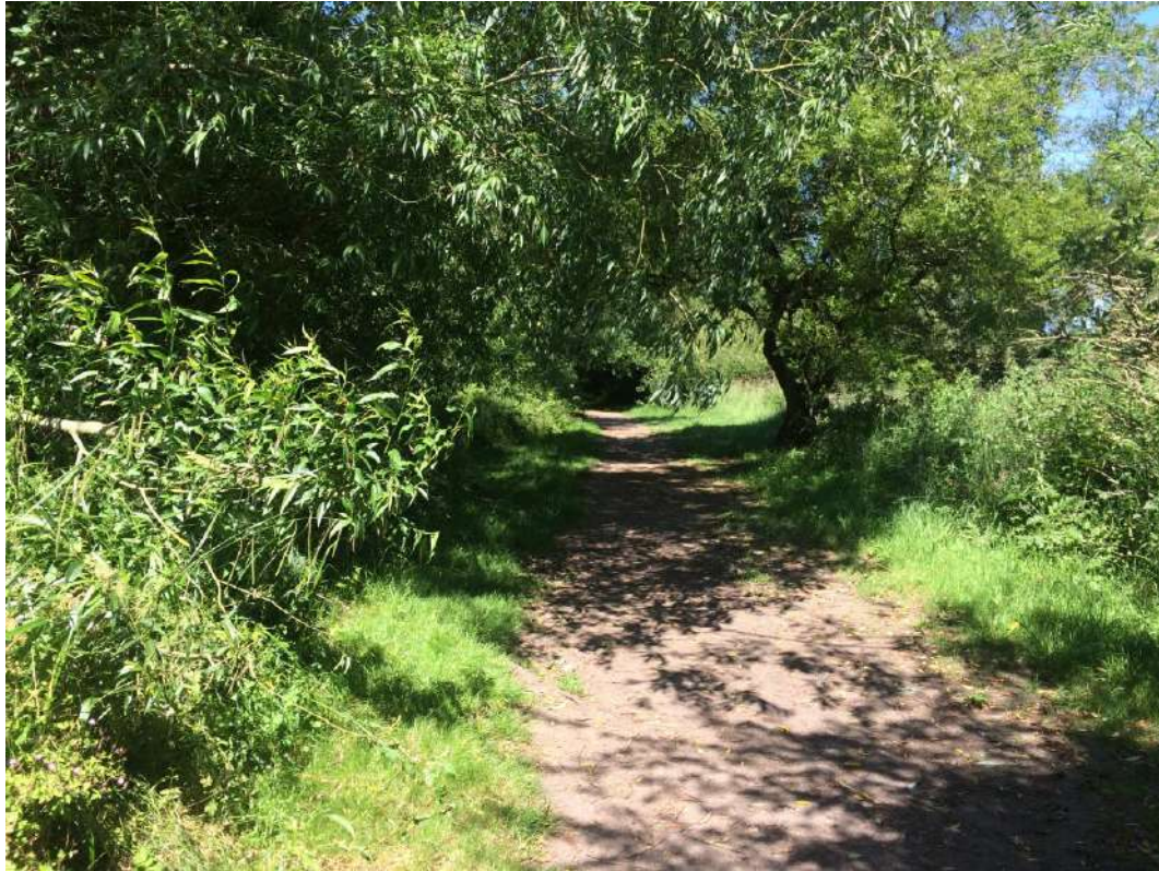
Section 10 (path)