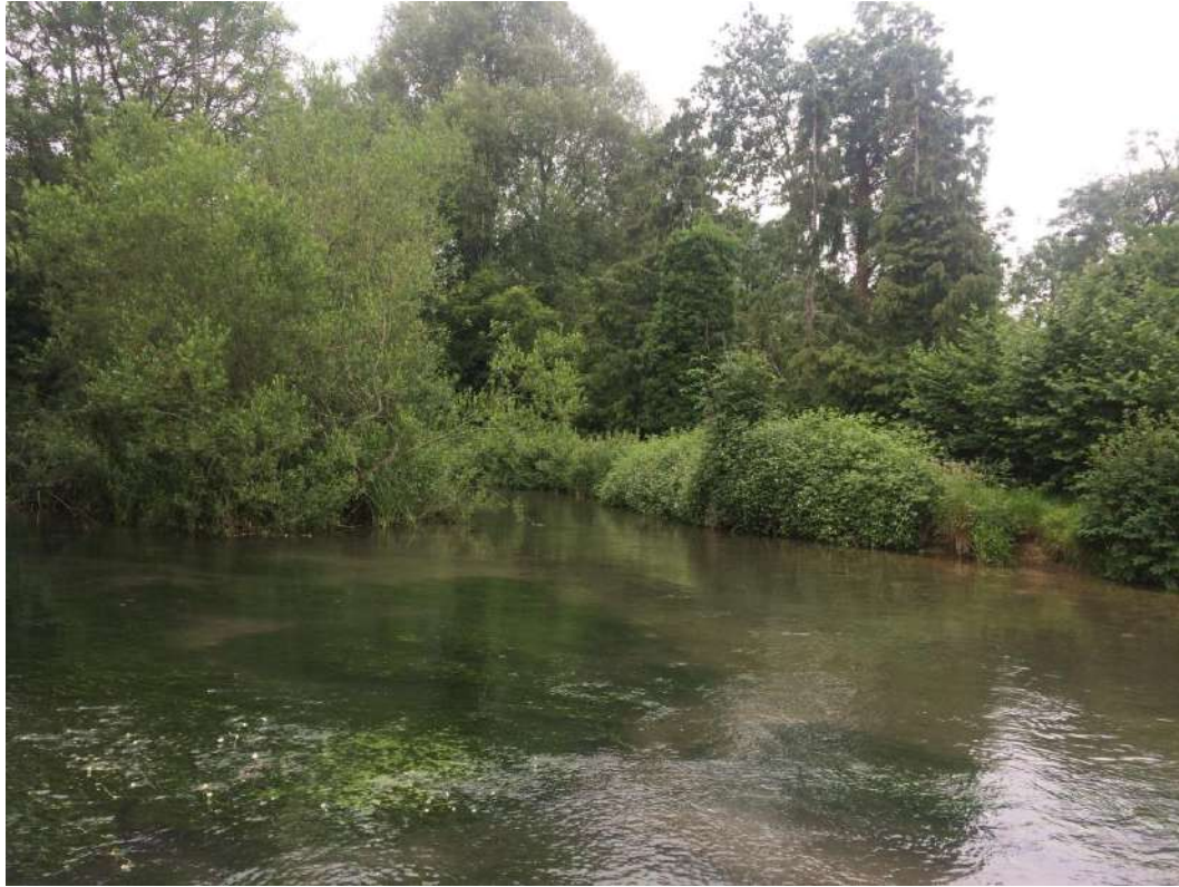
Section 1 (left bank of river and island, photo taken facing upstream)