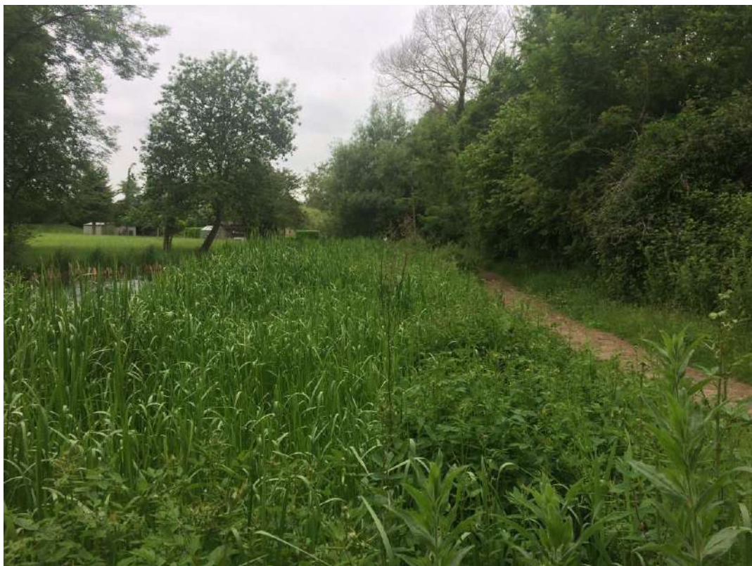
Section 5 (river, left bank, photo taken when facing upstream)