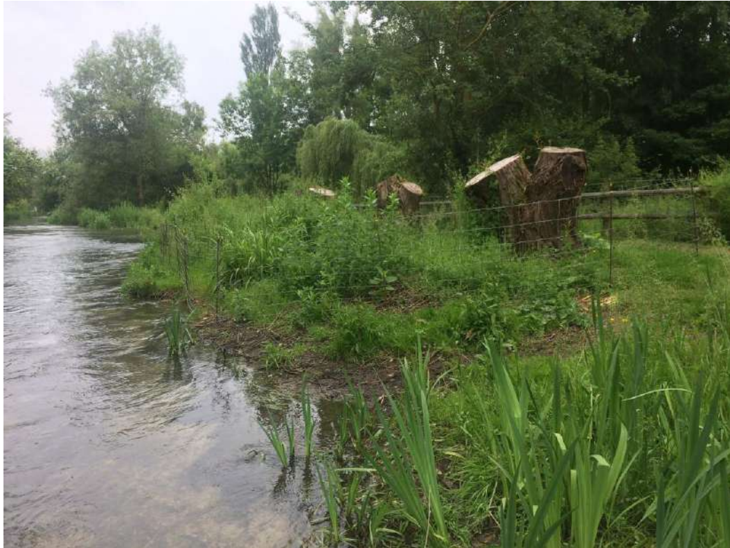
Section 7 (river, left bank, photo taken when facing upstream)