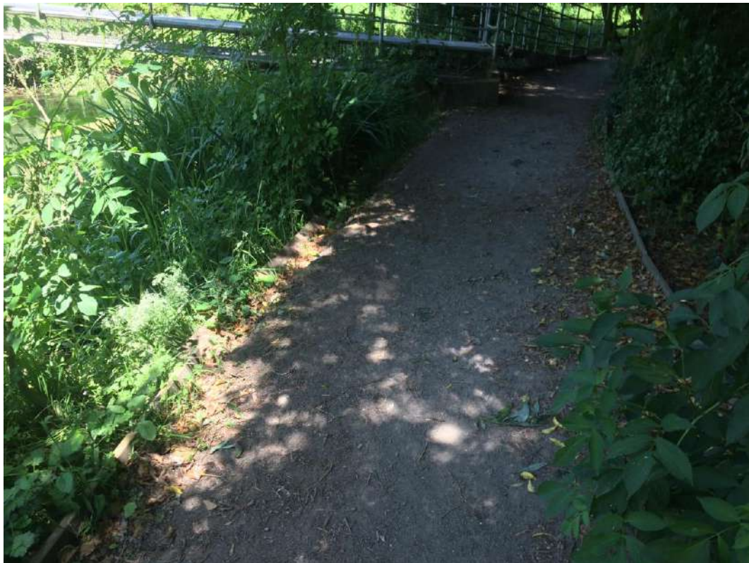
Section 1 (path)