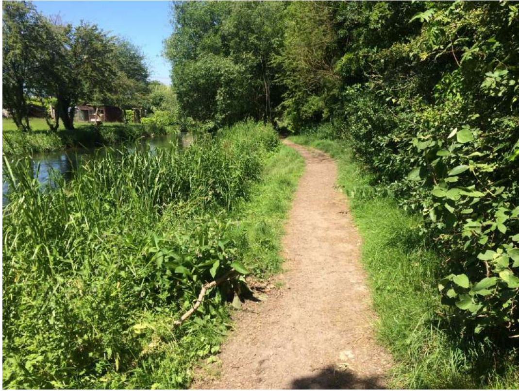
Section 5 (path)