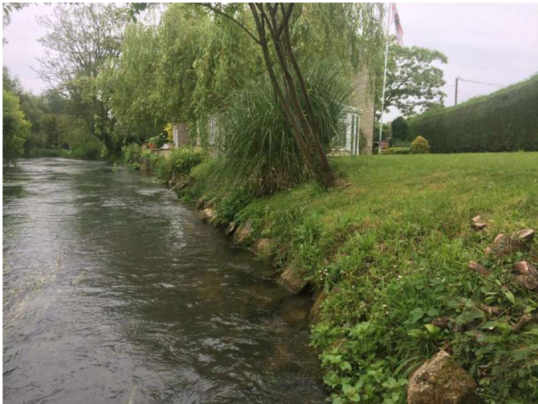
Section 2 (right bank of river, photo taken facing downstream)