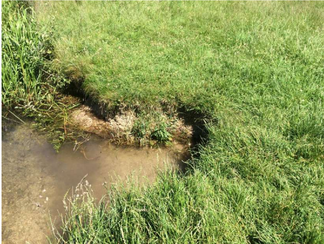
Eroded bank at 11a