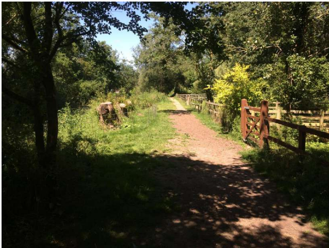
Section 7 (path)