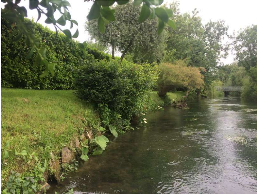
Section 2 (right bank of river, photo taken facing upstream)