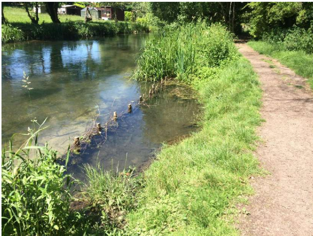
Eroded bank between sections 4 and 5