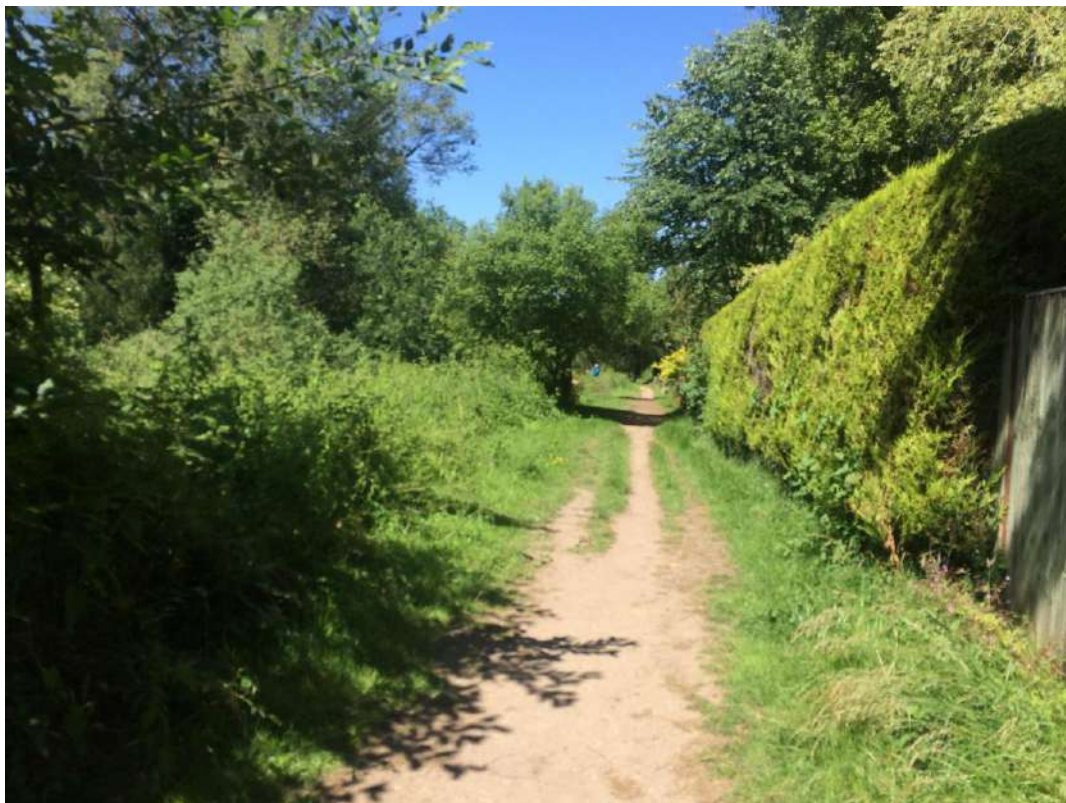
Section 8 (path)