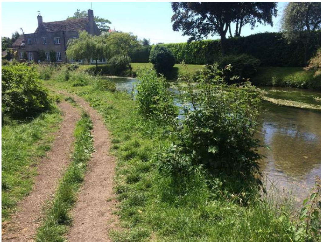
Section 2 (path)