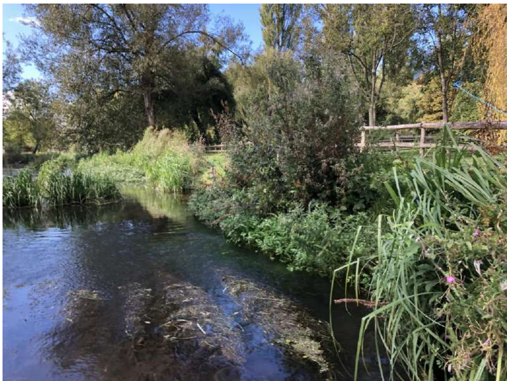
Coir fibre rolls installed in Section 6 where displacement took place; vegetation is well-established by September 2020 and water voles are present