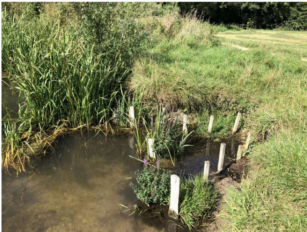
Additional coir roll added, and vegetation at 11a is starting to recover (September 2020)