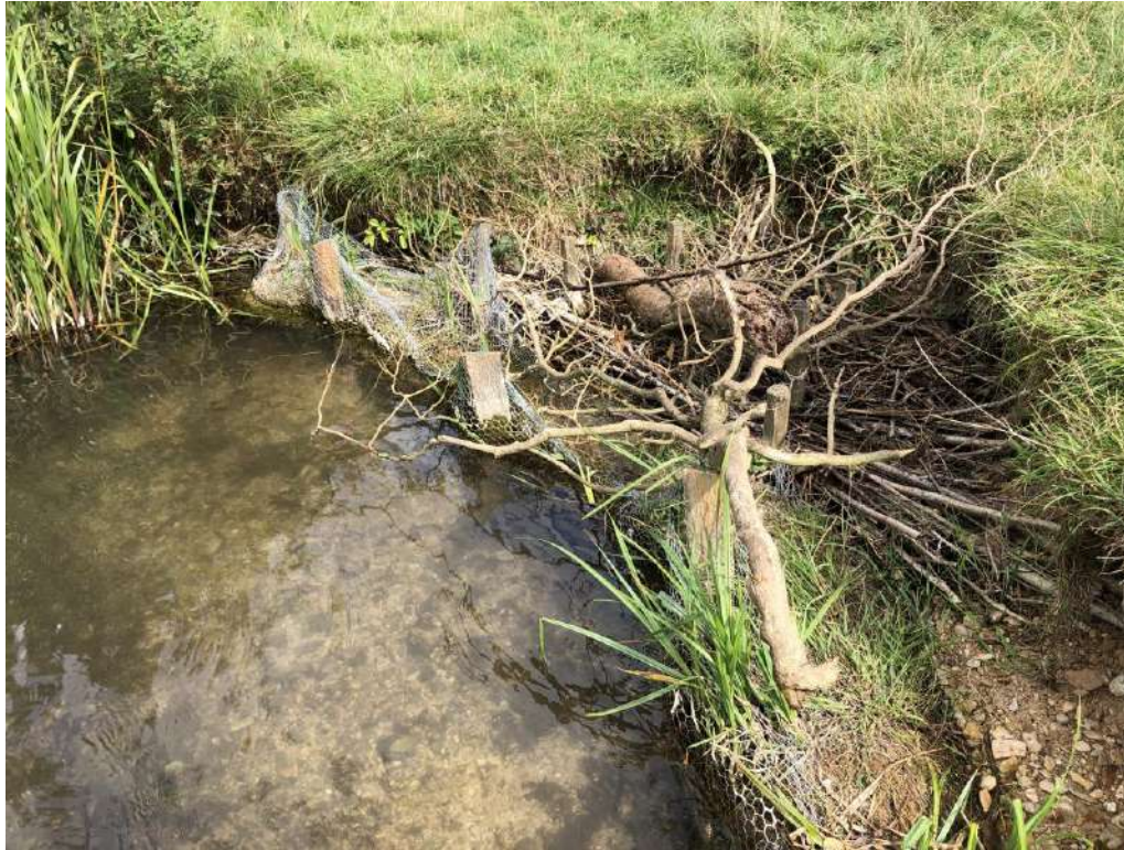
Damaged coir fibre roll installed in front of eroded bank at 11a (September 2019)