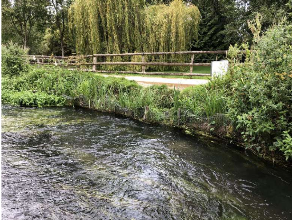
Coir fibre rolls installed in Section 6 where displacement took place; vegetation still establishing in September 2019