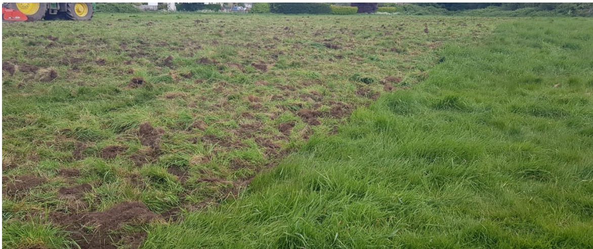
Figure 1. turf cultivated with powered equipment

Fairford is located along a "bee-line" so adding wildflower areas, allows movement through the town for insects. Not only helping locally but adding to a landscape scale helping support biodiversity regionally.