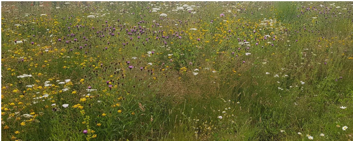
Figure 3 meadow year 2 with more of the wildflowers coming through

We will be selecting native perennial wildflowers and introducing these to existing grass areas. As many species require the right conditions to grow and can take several seasons to flower many areas will take more than one summer before producing flowers, so we ask for your patience while they are establishing.