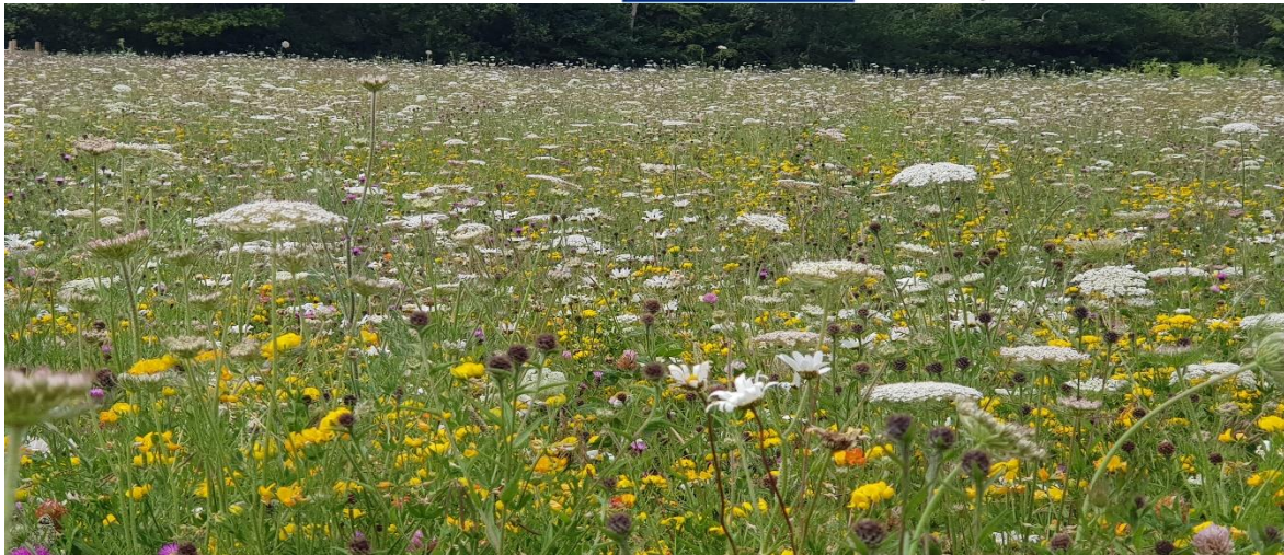
Figure 4 meadow year 3 high percentage of wildflowers now present