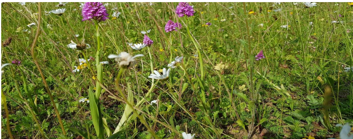
Figure 5 meadow year 5 a well-established meadow with little to no grass

For instant effect other areas will have native bulbs planted giving brilliantly bright bouquets to benefit bugs and brighten borders.