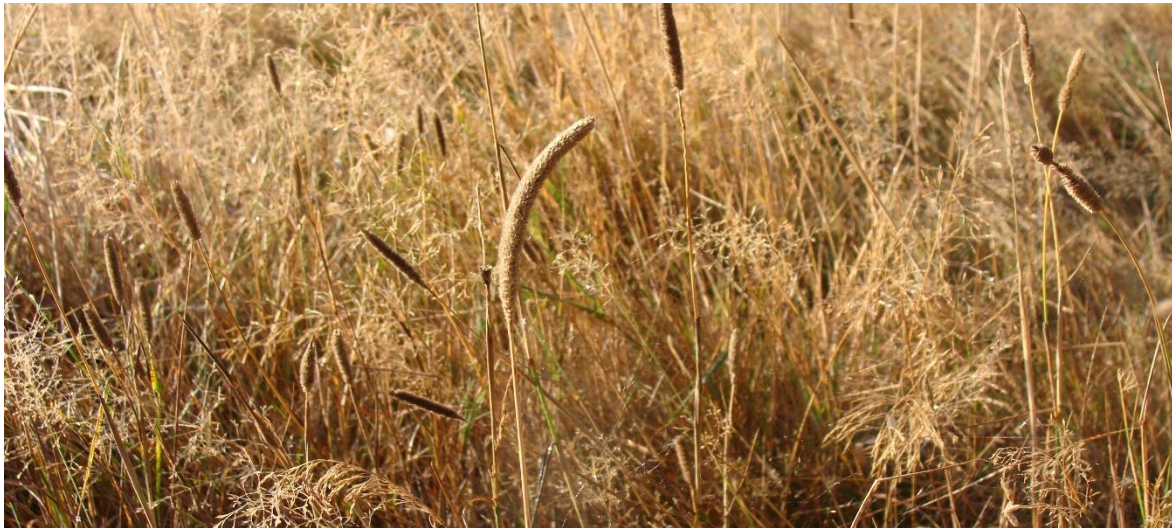
Figure 2 meadow growth year 1 with high percentage of grasses

March to April, to even out winter growth, and at the end of the season, in September, once the plants have gone to seed.